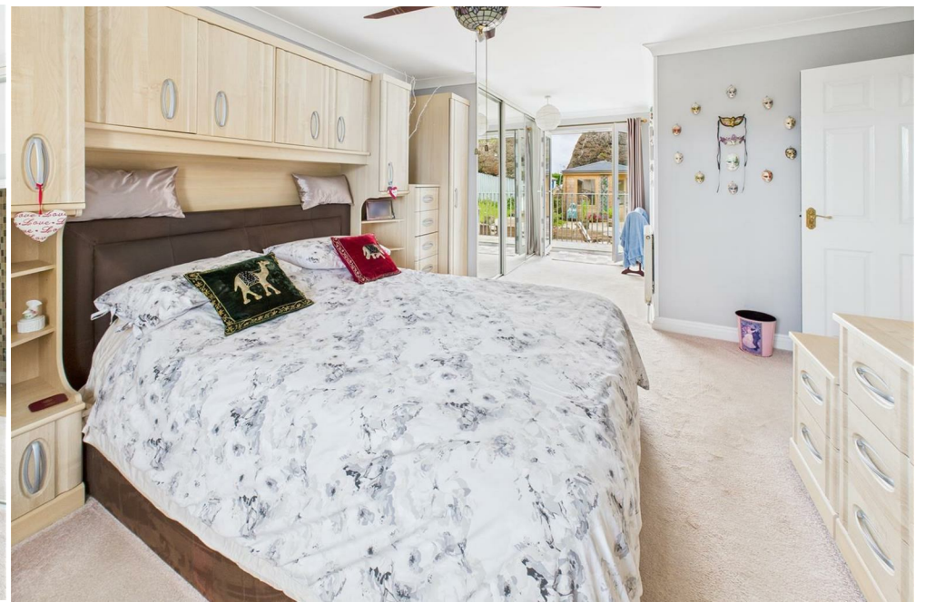
Heather Lane, Canonstown, Hayle, TR27 6NG