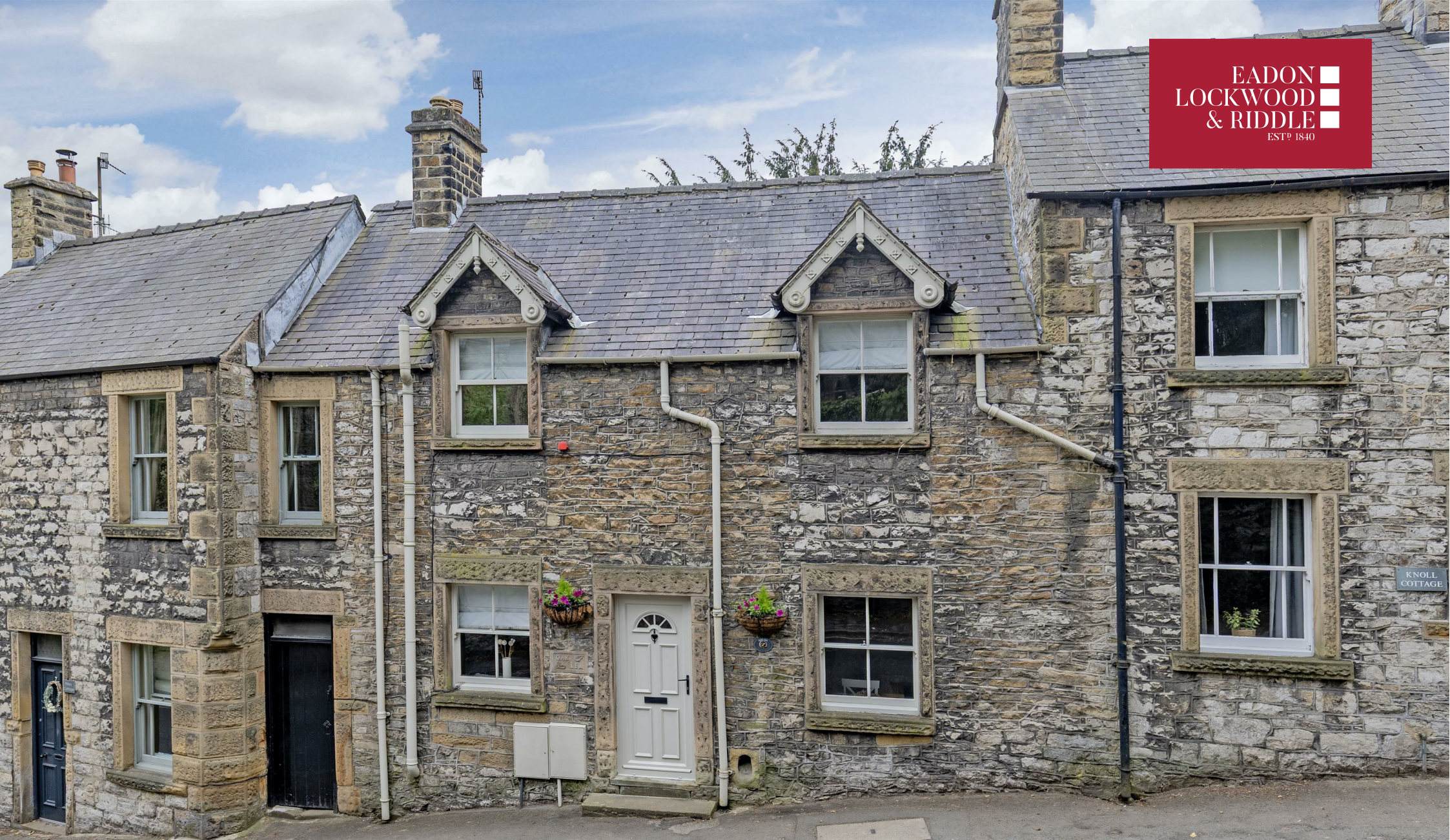
Oak Lea, South Church Street, Bakewell, DE45 1FD