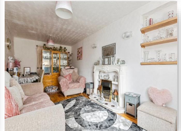
Knole Road, Billingham TS23 3AQ