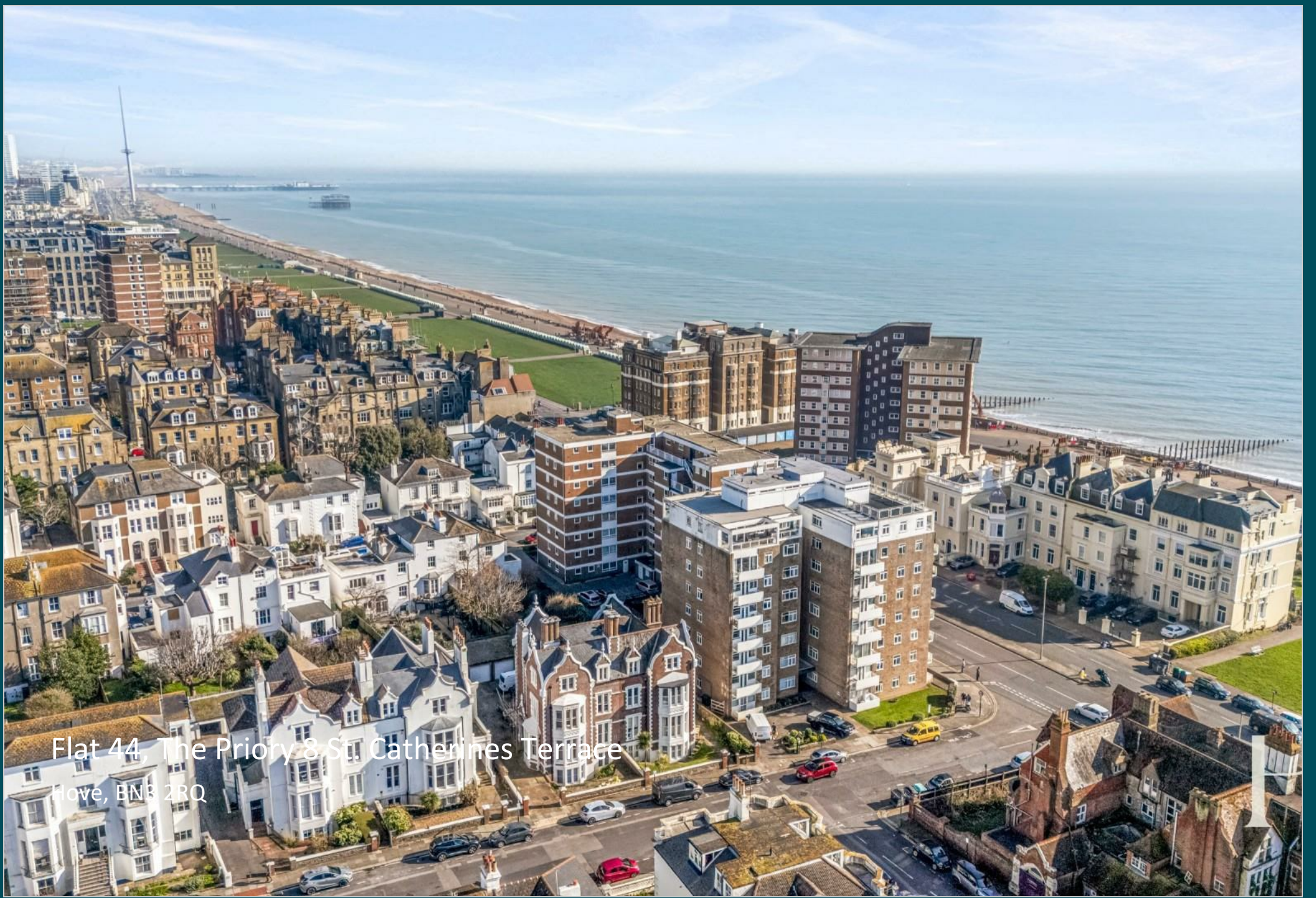
Flat 44, The Priory 8 St. Catherines Terrace Hove, BN3 2RQ