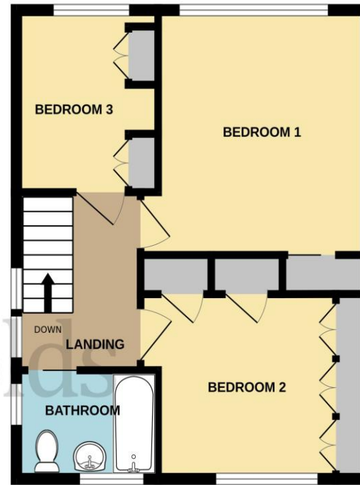
TOTAL FLOOR AREA : 117.9 sq.m. (1269 sq.ft.) approx.

Whilst every attempt has been made to ensure the accuracy of the floorplan contained here, measurements of doors, windows, rooms and any other items are approximate and no responsibility is taken for any error, omission or mis-statement. This plan is for illustrative purposes only and should be used as such by any prospective purchaser. The services, systems and appliances shown have not been tested and no guarantee as to their operability or efficiency can be given. Made with Metropix ©2026