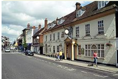
Alton High Street