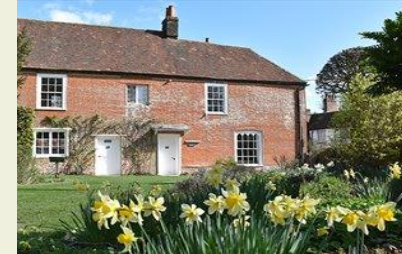
Jane Austen's House

Cognatum Property Limited, Pipe House, Lupton Road, Wallingford, Oxfordshire OX10 9BS