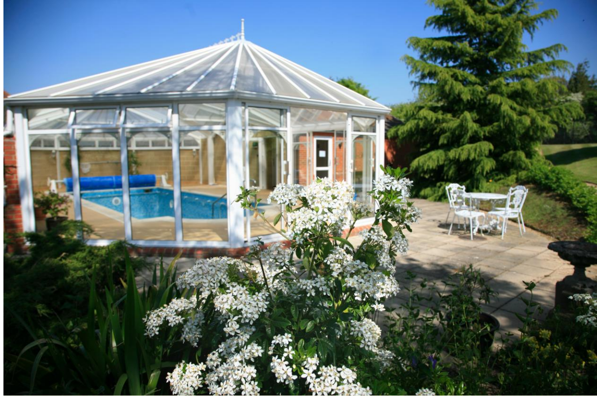
The central courtyard gardens