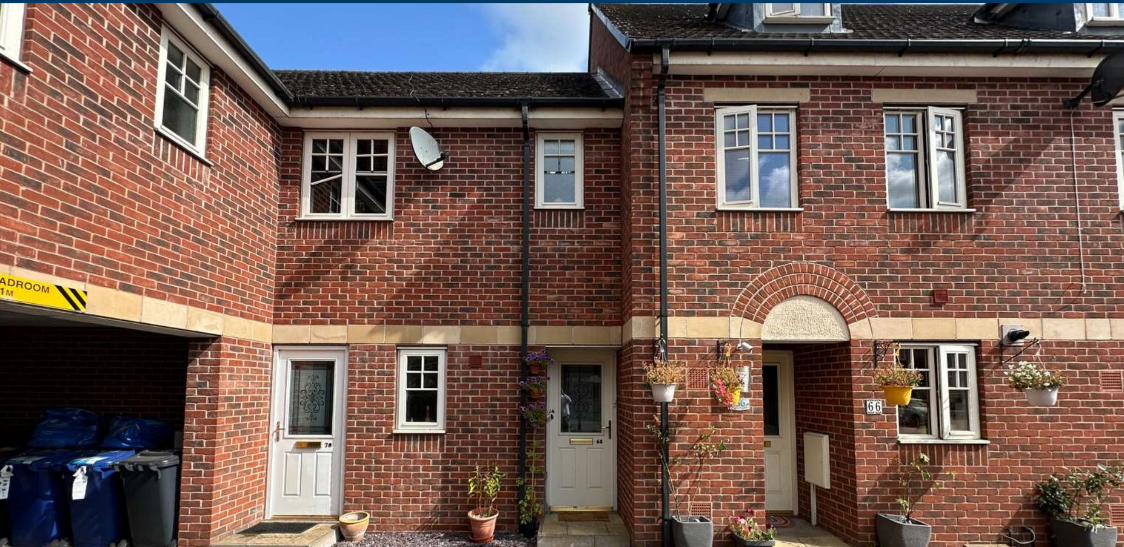
Caroline Court, Burton-on-Trent