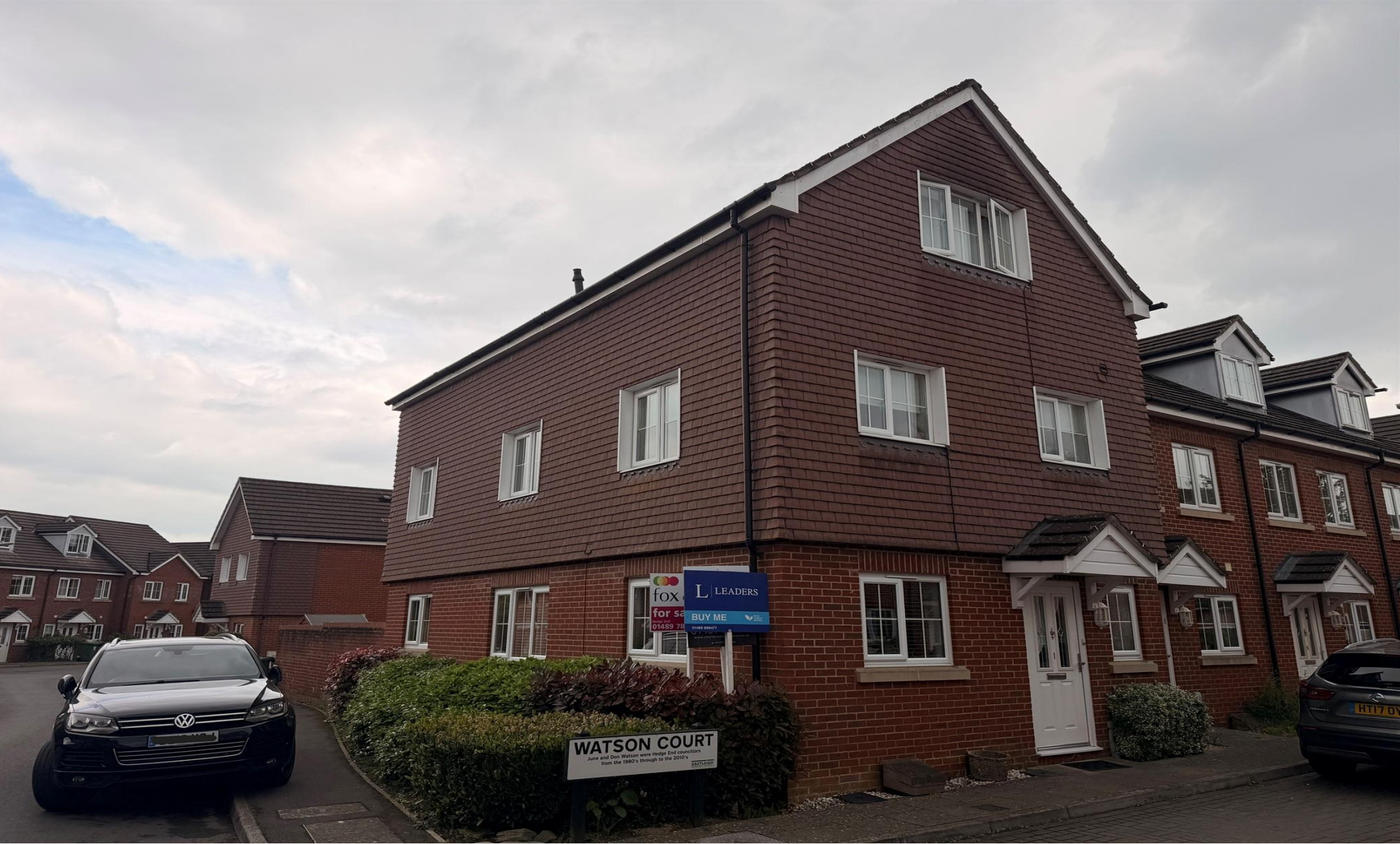
Watson Court, Hedge End, Southampton, SO30 0AQ