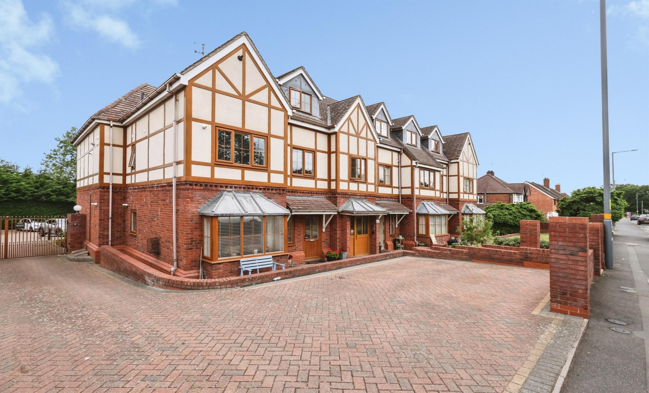
Barrows Manor, Barrows Lane, Birmingham