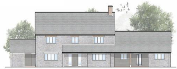
PROPOSED WEST (FRONT) ELEVATION