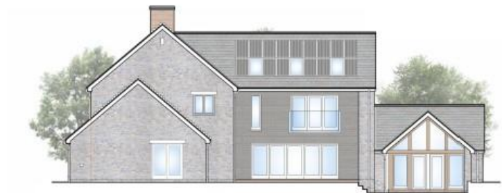
PROPOSED SOUTH (SIDE) ELEVATION