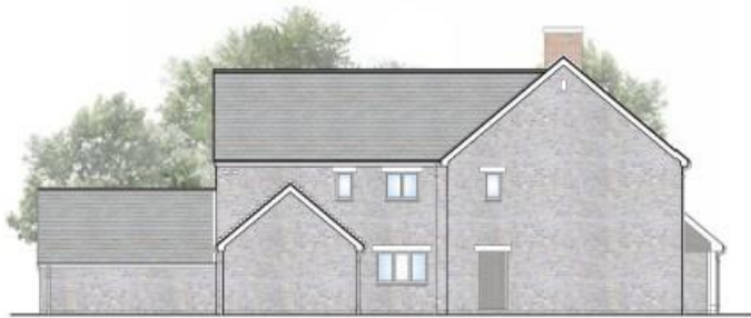
PROPOSED NORTH (SIDE) ELEVATION