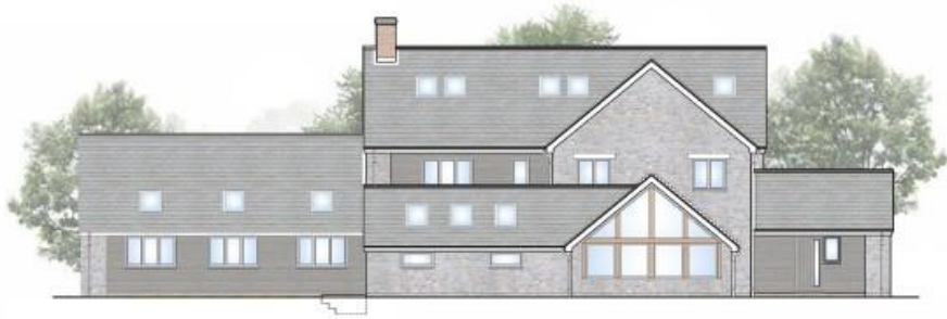
PROPOSED EAST (REAR) ELEVATION