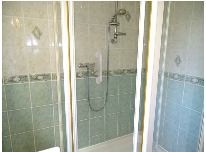
SHOWER ROOM 6'2 x 5'10 (1.88m x 1.78m)

White suite comprising vanity wash hand basin, low level wc, shower unit, chrome heated towel rail, three inset ceiling spot lights, fully tiled walls, frosted upvc double glazed window to side.