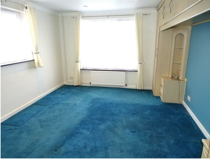
BEDROOM ONE 13'6 x 11'10 (4.11m x 3.61m)

Radiator, range of fitted furniture to include wardrobes, bedside drawer units, display shelves and wall cupboards, dual aspect upvc double glazed windows.