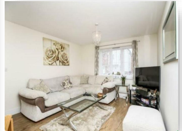
Overbeck House Kelmscott Way, Bognor Regis PO21 5DU