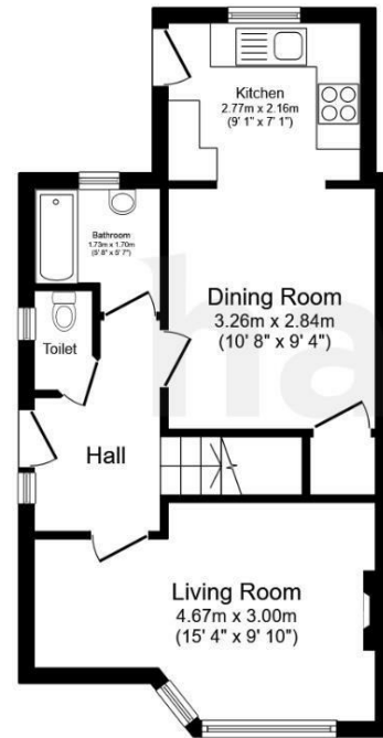
Ground Floor Floor area 38.6 sq.m. (415 sq.ft.)

This home stands out from others in the area thanks to its substantial rear extension—offering far more practical living space than a typical conservatory—as well as its quiet cul-de-sac location away from busy main roads. The property also boasts level access to both the front entrance and rear garden, enhancing convenience for a wide range of buyers. Additionally, the garage is conveniently located directly off the driveway, rather than being set away in a separate block, adding to the home's overall practicality and appeal.