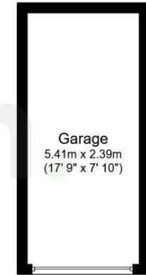
Garage Floor area 12.7 sq.m. (137 sq.ft.)

Total floor area: 84.2 sq.m. (906 sq.ft.)