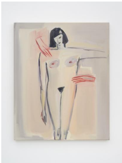
Eve Ackroyd, The Model