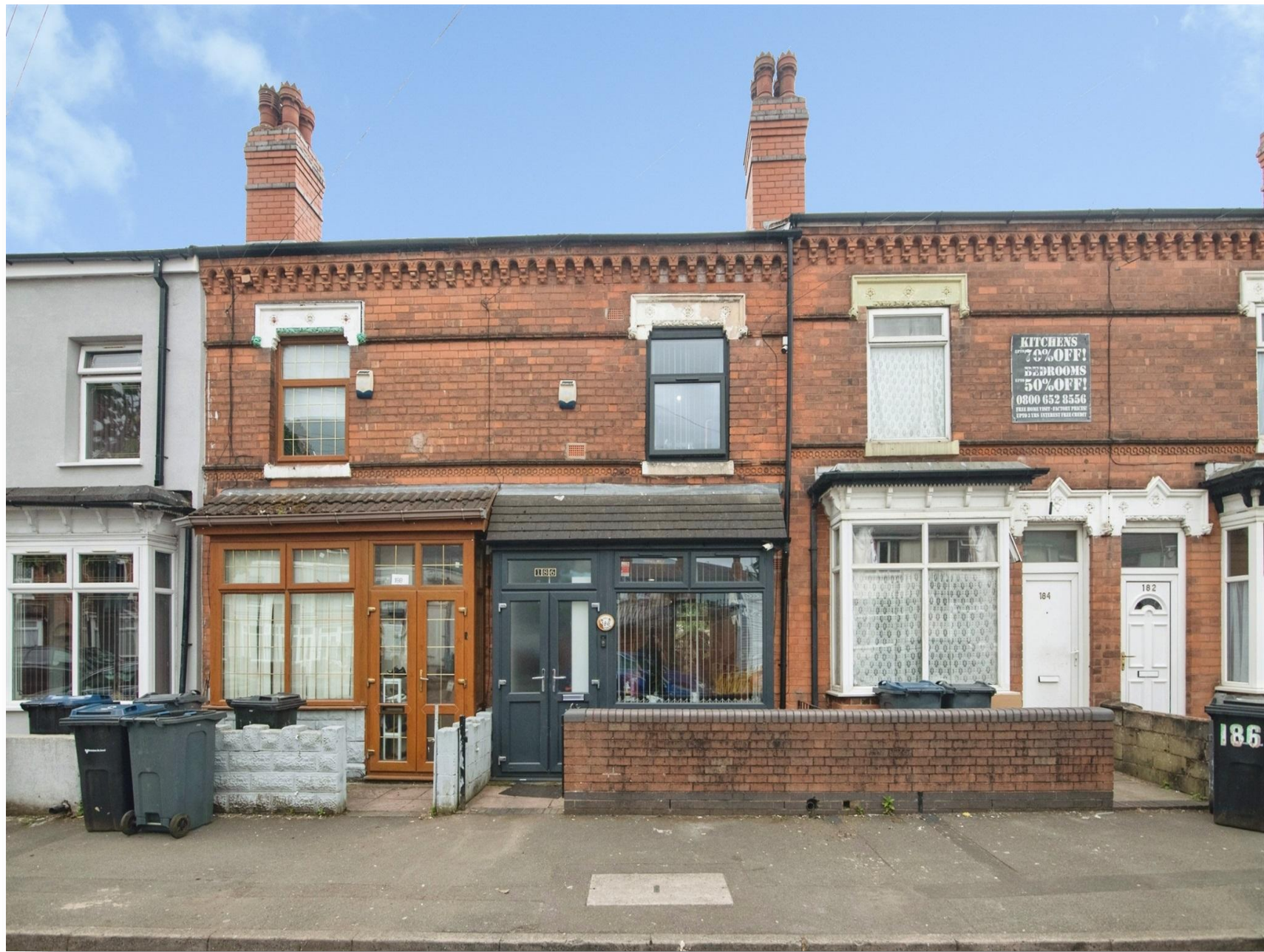
Normandy Road, Birmingham B20 3BA