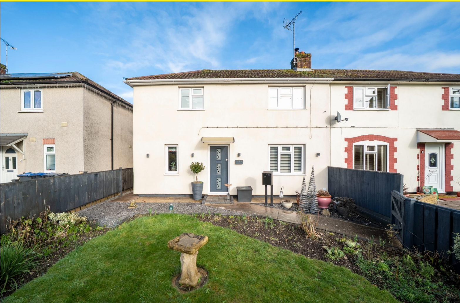
Andover Road, Ludgershall Guide Price £325,000 Freehold