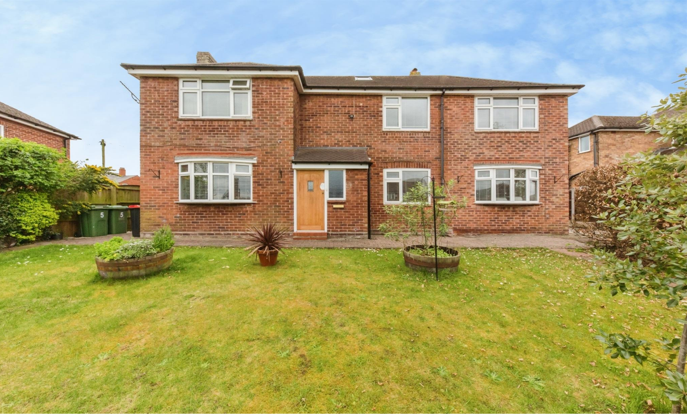
Townfields Crescent, Winsford CW7 1EJ