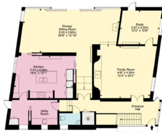
Ground Floor Main House

(Not shown in actual location or orientation.)