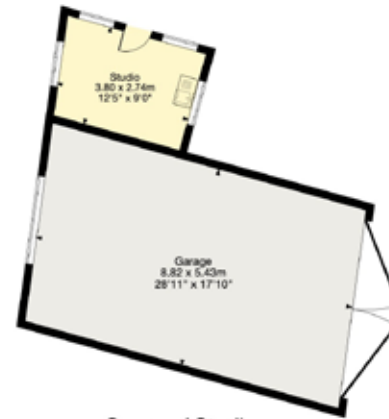
Garage / Studio

(Not shown in actual location or orientation.)