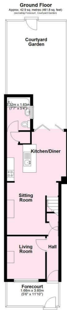
Total area: approx. 42.9 sq. metres (461.8 sq. feet) Not to scale for illustrative purposes only. Approximate gross internal floor area. (Excluding balconies and any storage). All measurements and figures including doors and windows are approximate and should be independently verified. Plan produced using PlanIt.