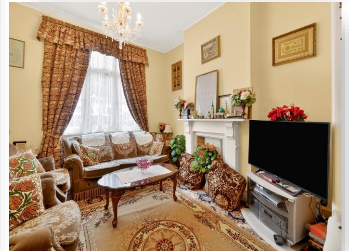
Algarve Road, London SW18 3EQ