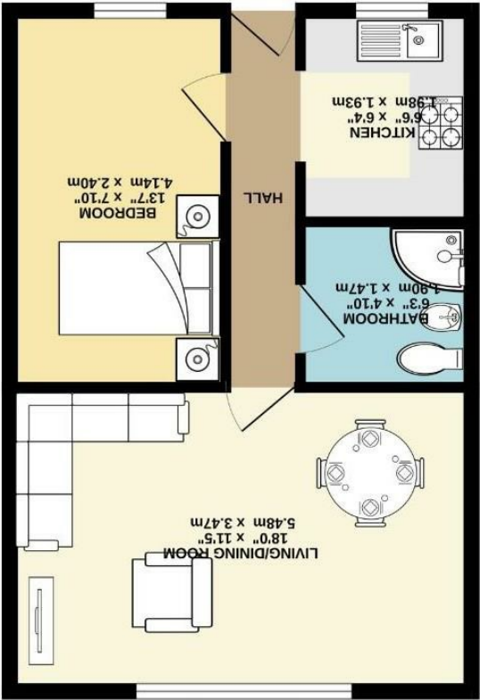
GROUND FLOOR 418 sq.ft. (38.9 sq.m.) approx.

TOTAL FLOOR AREA: 418 sq.ft. (38.9 sq.m.) approx. Measurements are approximate. Not to scale. Illustrative purposes only. Made with AutoCAD 2023