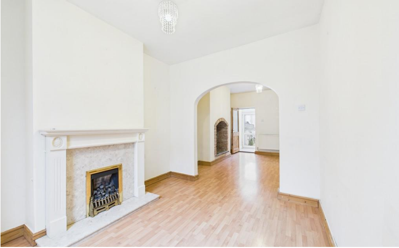
Lounge through to Dining Room