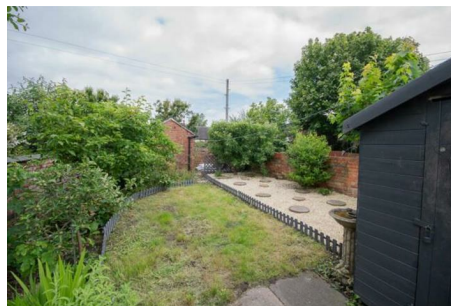
A pathway from the property leads to a delightful 'secret garden' boasting a range of fruit trees, lawn, shrubs and outbuildings.