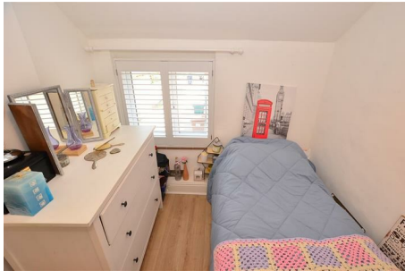
Having radiator and UPVC double glazed window.