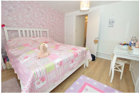
Second Bedroom 7'6" x 6'10" (2.3 x 2.1)

Weston Road, Aston-On-Trent, Derby, DE72 2AS