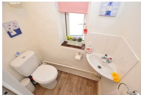
Having white two piece suite.