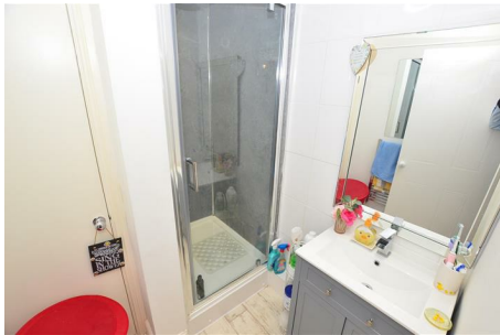
Having white two piece suite with full height storage cupboard.