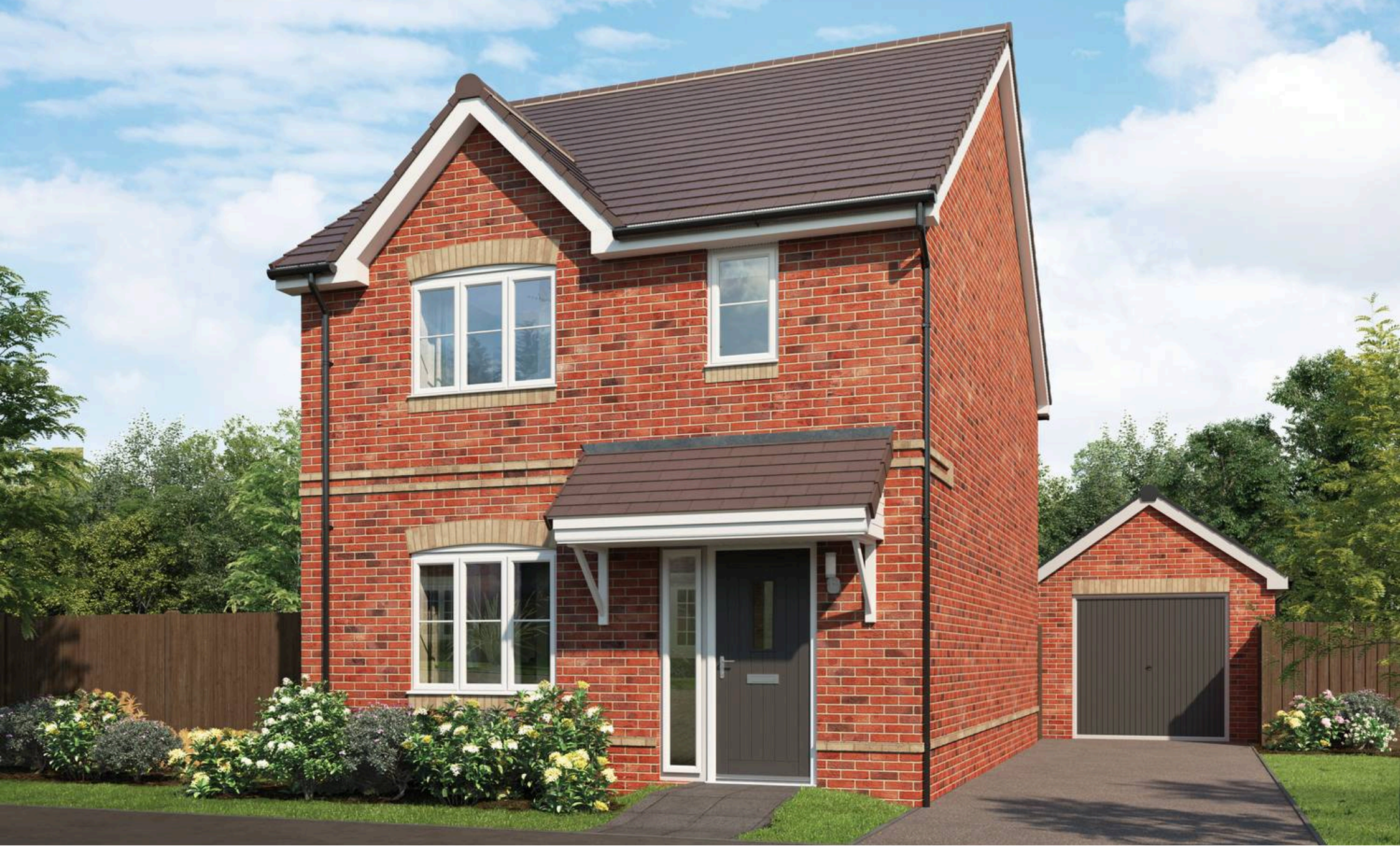
Coppice, Calne Road Chippenham