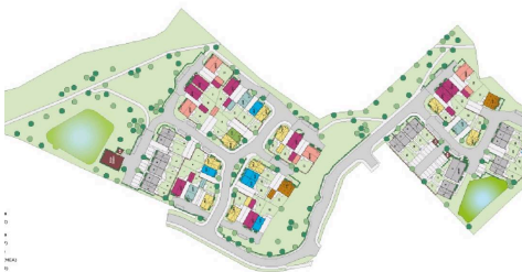
LYNEHAM MEADOWS DEVELOPMENT PLAN