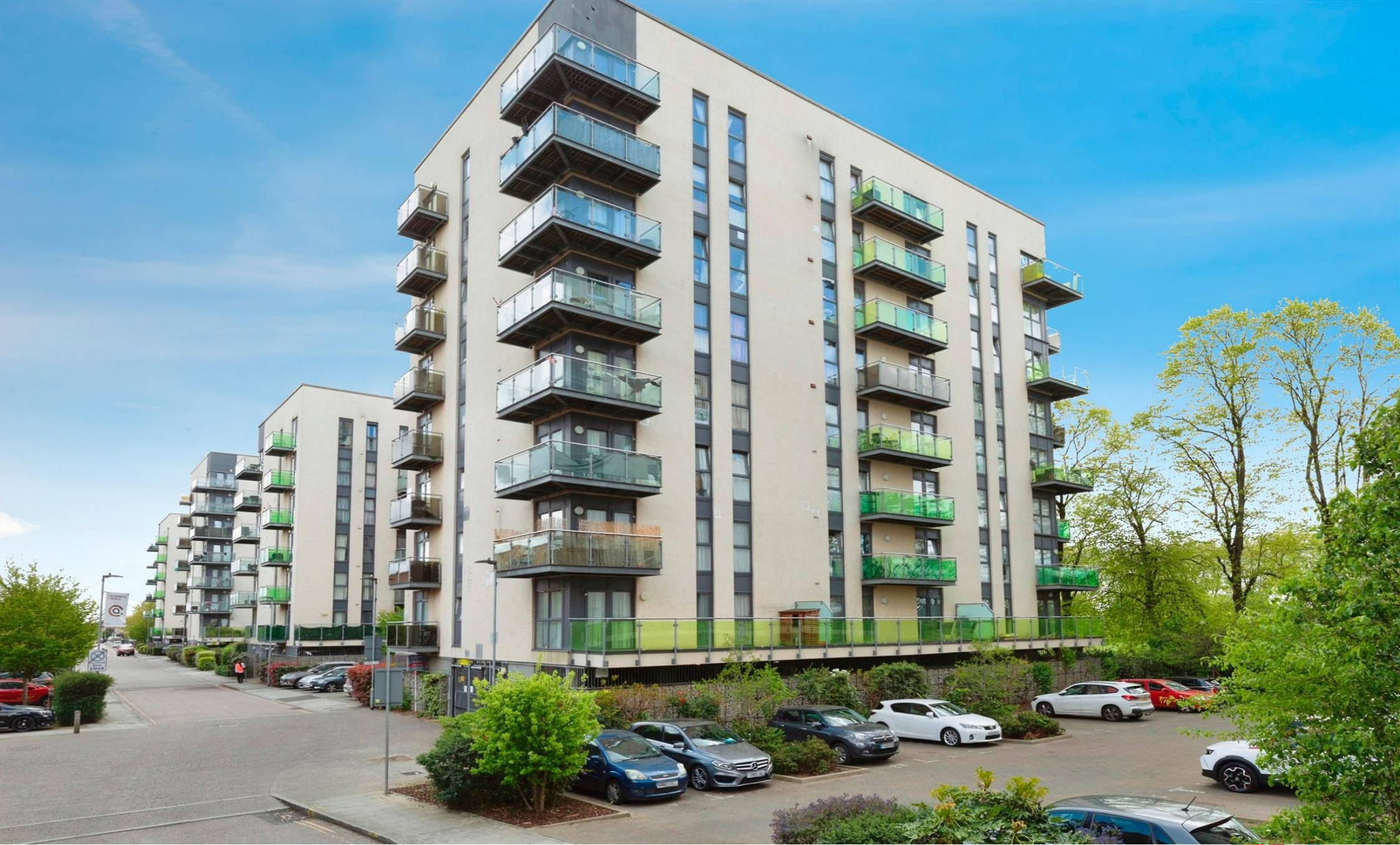
Roehampton House, Academy Way, Dagenham, RM8 2FJ