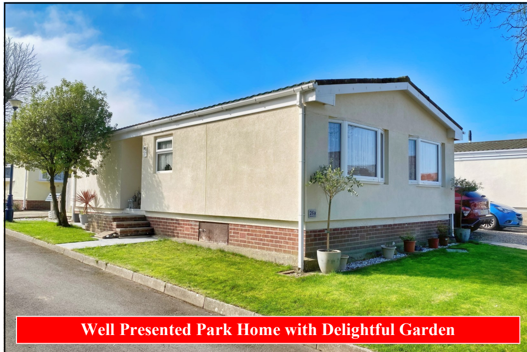
Well Presented Park Home with Delightful Garden

26a Oaklands Park, Crossways, Nr Dorchester, Dorset. DT2 8JQ