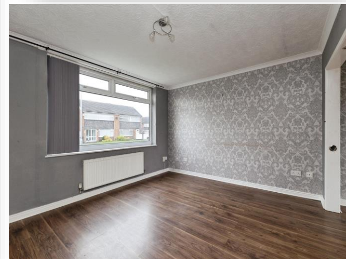
Cawood Drive, Middlesbrough TS5 7JP