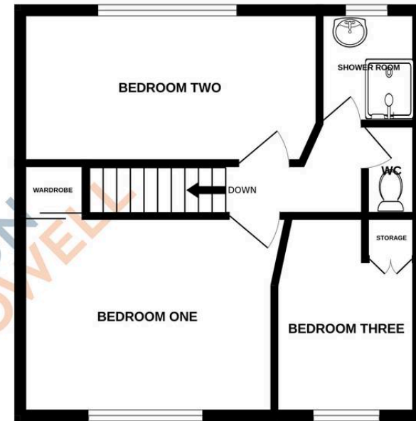
TOTAL FLOOR AREA : 963 sq.ft. (89.5 sq.m.) approx.

Whilst every attempt has been made to ensure the accuracy of the floorplan contained here, measurements of doors, windows, rooms and any other items are approximate and no responsibility is taken for any error, omission or mis-statement. This plan is for illustrative purposes only and should be used as such by any prospective purchaser. The services, systems and appliances shown have not been tested and no guarantee as to their operability or efficiency can be given. Made with Metropix ©2026