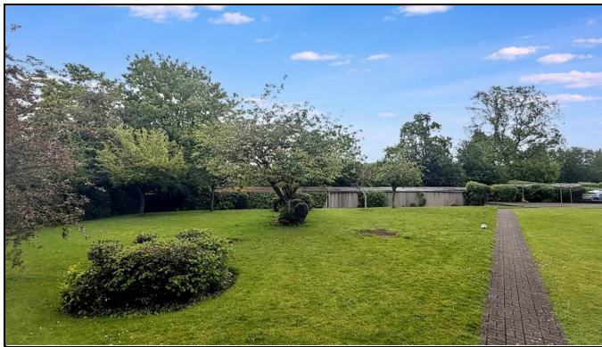
Packington Court, Blackberry Lane, Four Oaks