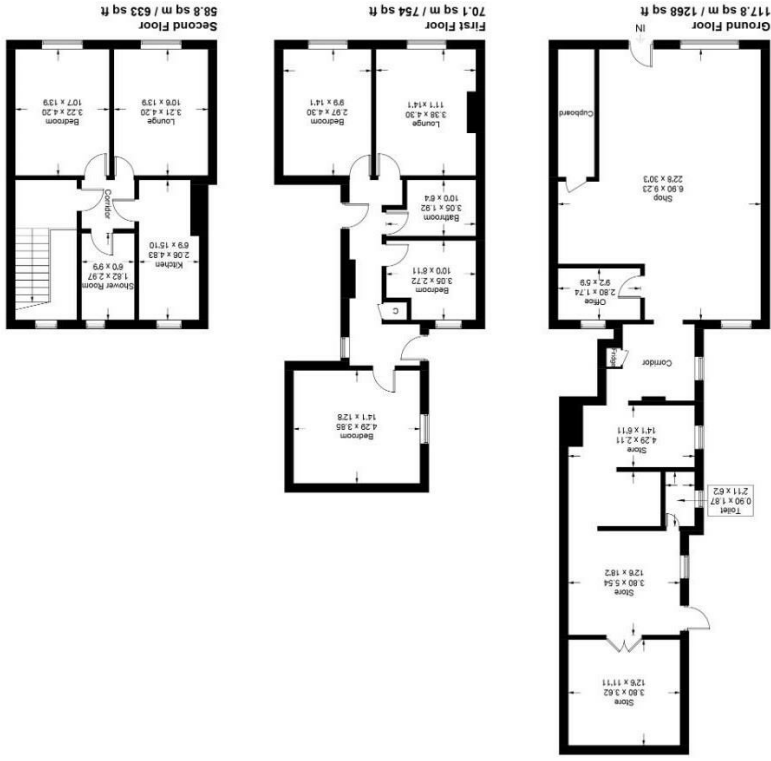
Illustration for identification purposes only. measurements are approximate, not to scale.

NOTE: The Agents have not tested any electrical installations, central heating system or other appliances and services referred to in these particulars and no warranty is given as to their