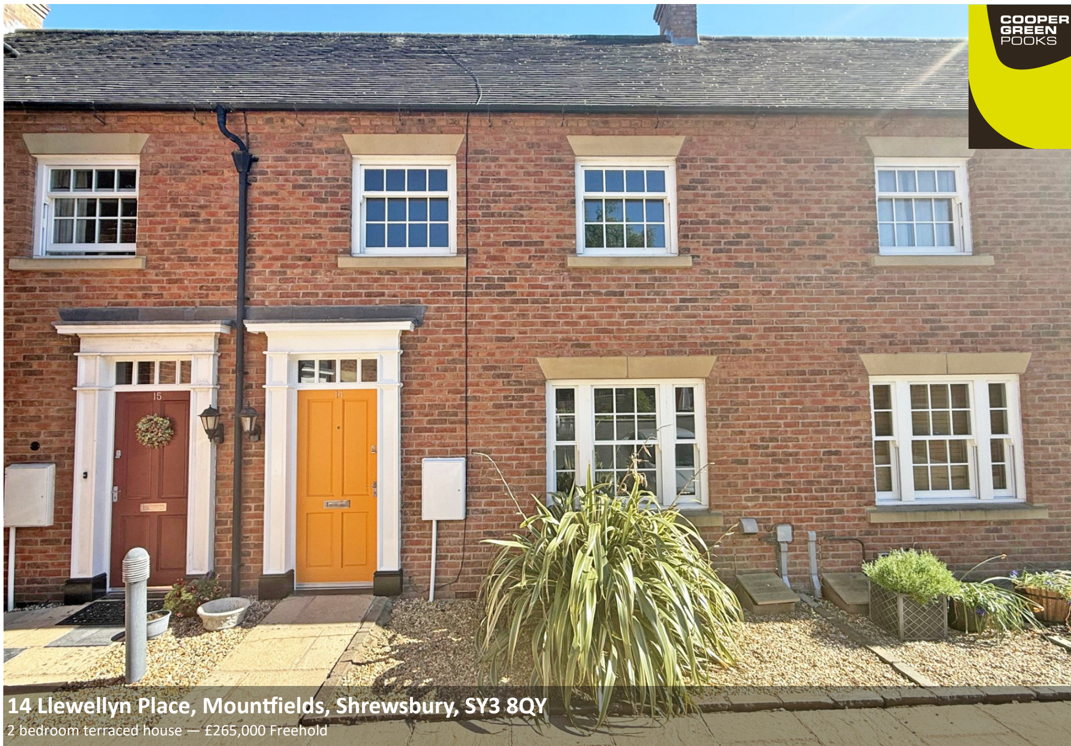
14 Llewellyn Place, Mountfields, Shrewsbury, SY3 8QY

2 bedroom terraced house — £265,000 Freehold