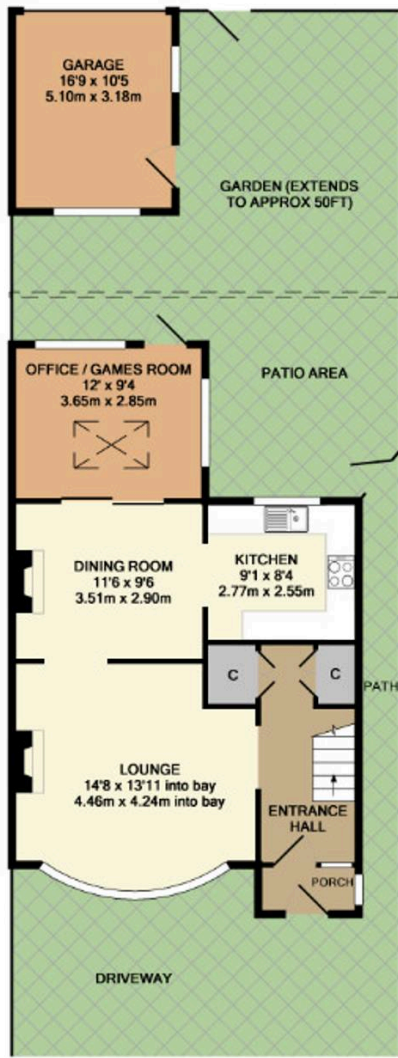
GROUND FLOOR APPROX. FLOOR AREA 899 SQ.FT. (85.0 SQ.M.)