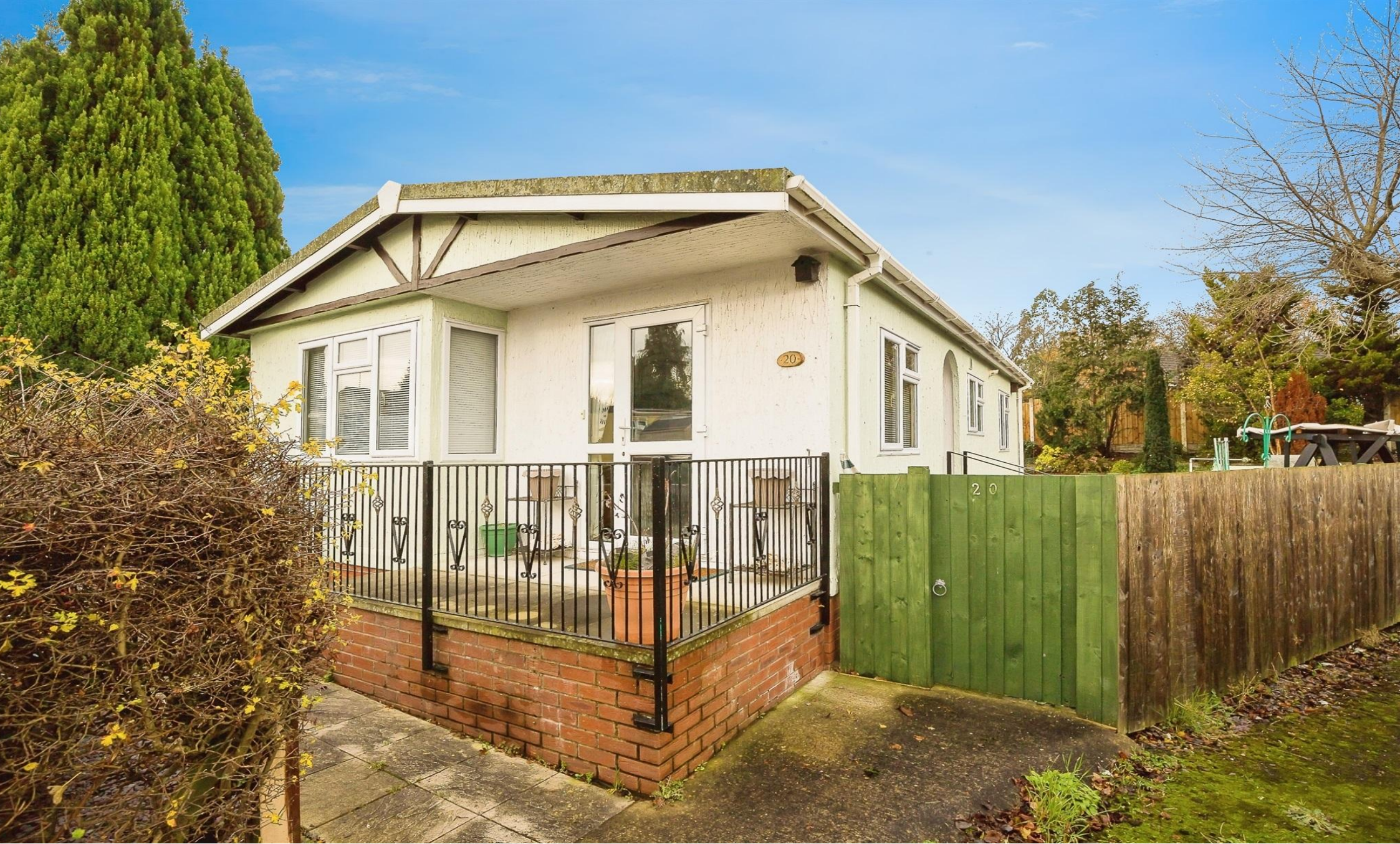
Orchard Park, Elton Chester CH2 4NQ