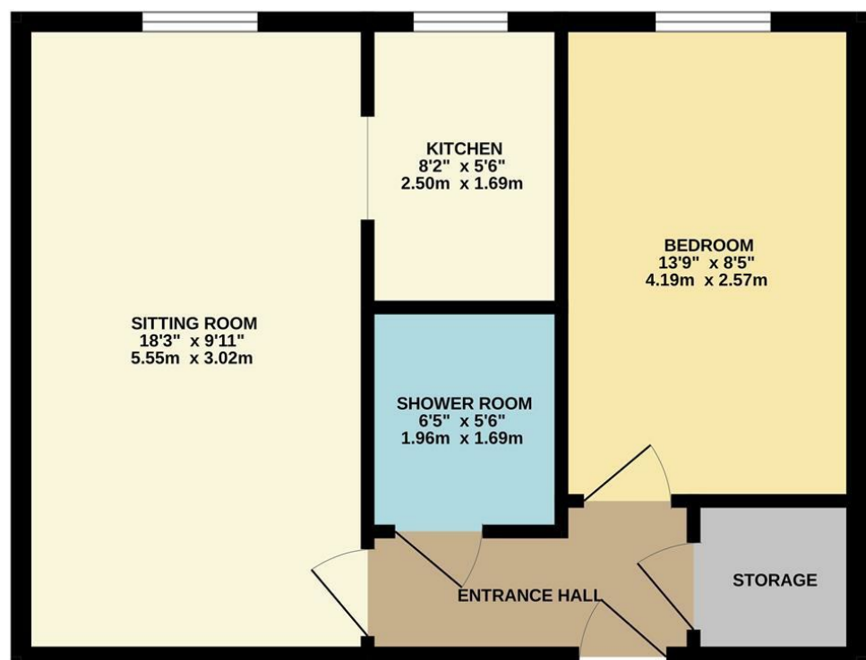
FIRST FLOOR 435 sq.ft. (40.4 sq.m.) approx.

TOTAL FLOOR AREA : 435 sq.ft. (40.4 sq.m.) approx. Whilst every attempt has been made to ensure the accuracy of the floorplan contained here, measurements of doors, windows, rooms and any other items are approximate and no responsibility is taken for any error, omission or mis-statement. This plan is for illustrative purposes only and should be used as such by any prospective purchaser. The services, systems and appliances shown have not been tested and no guarantee as to their operability or efficiency can be given. Made with Metropix ©2025