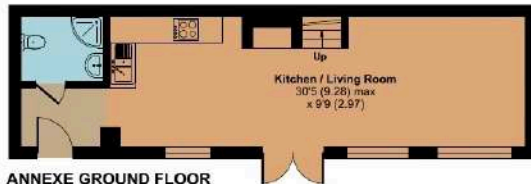
ANNEXE GROUND FLOOR