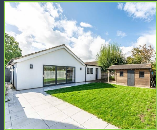
4 Bedroom Detached Bungalow £599,950 Freehold