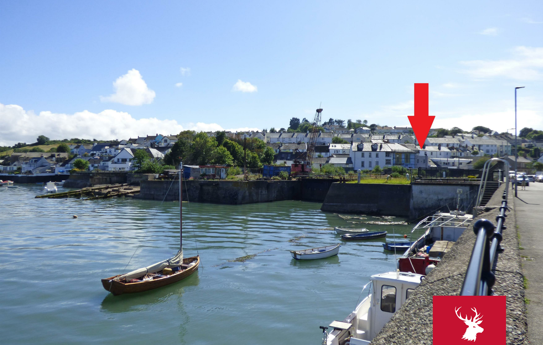
The Boat House