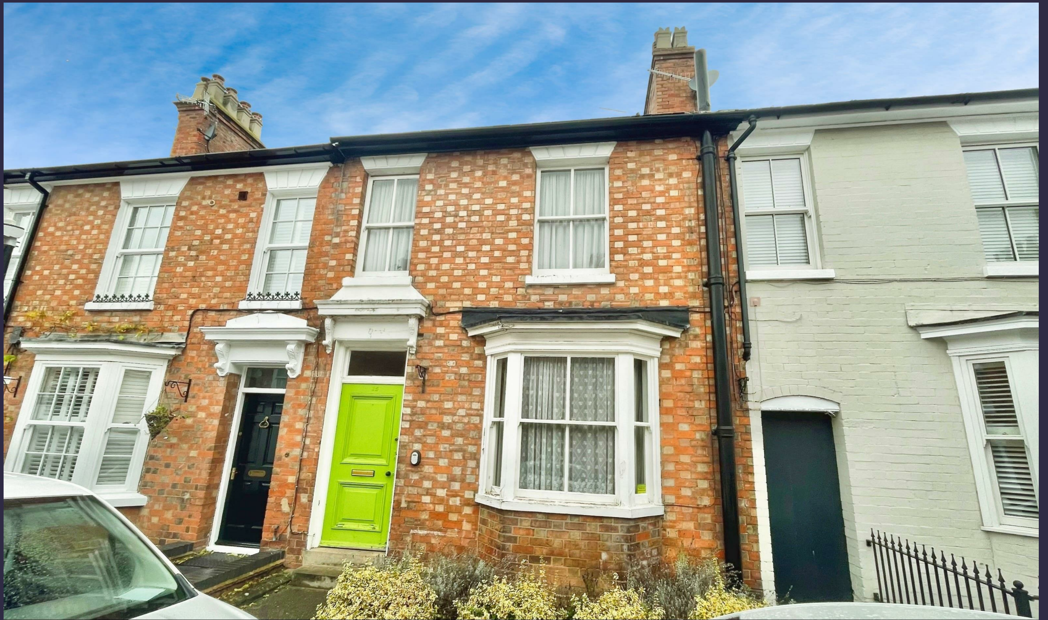
15 West Street, Stratford-upon-Avon, CV37 6DW