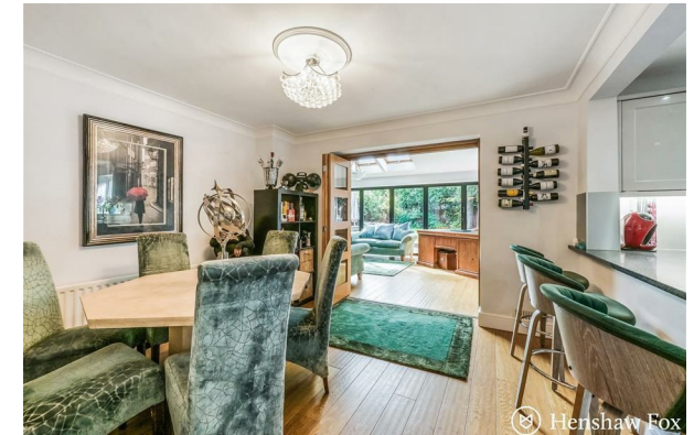
Oaktrees Sandy Lane | £850,000 Romsey, Hampshire, SO51 0PD