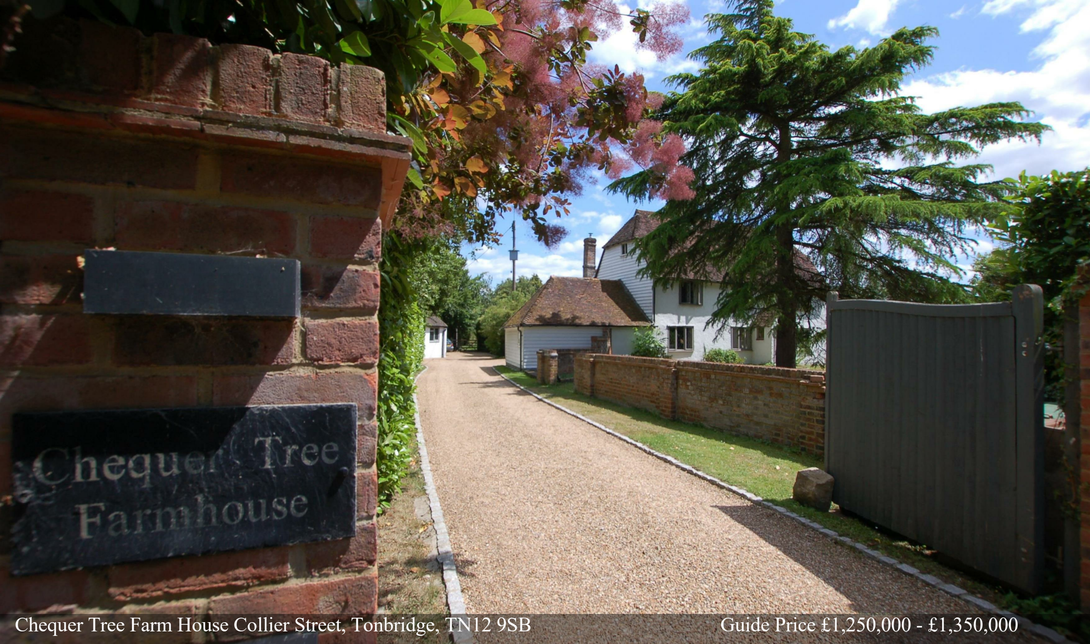
Chequer Tree Farm House Collier Street, Tonbridge, TN12 9SB