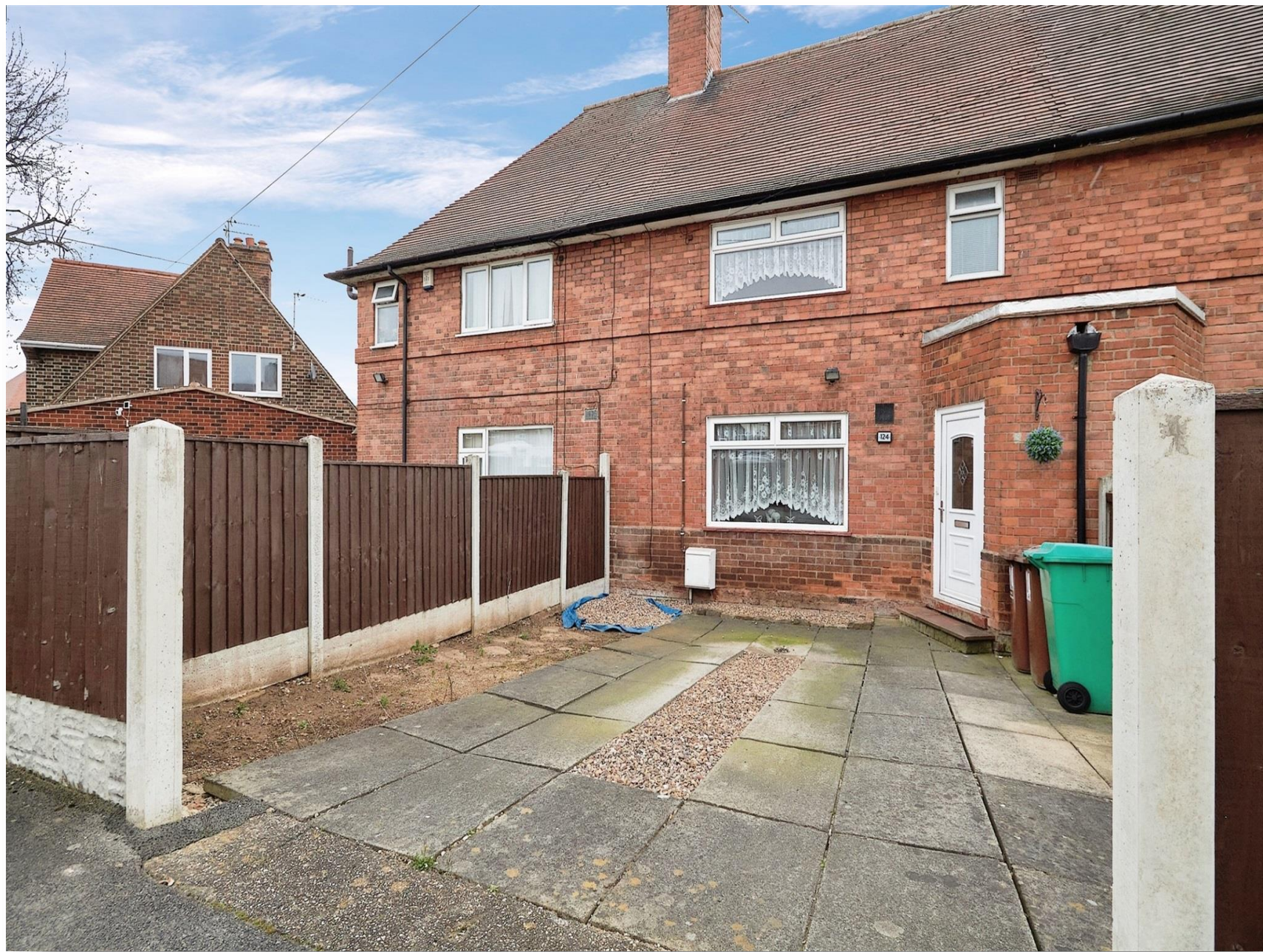
Tenbury Crescent, Nottingham NG8 5HW