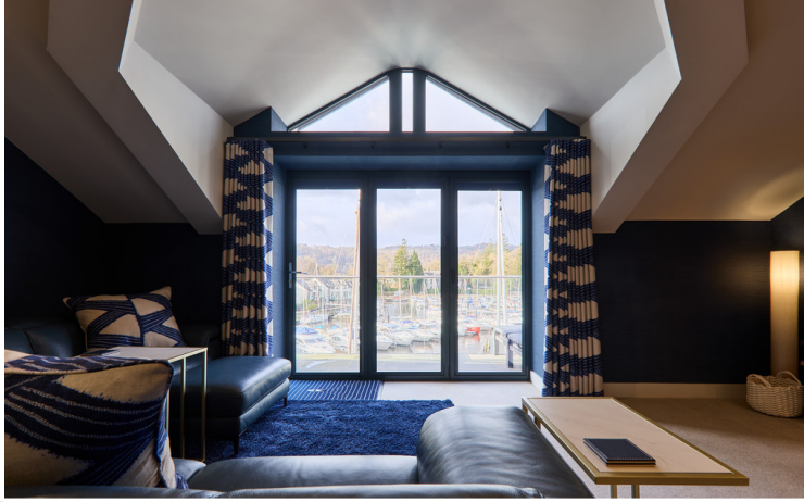
Views from the living room