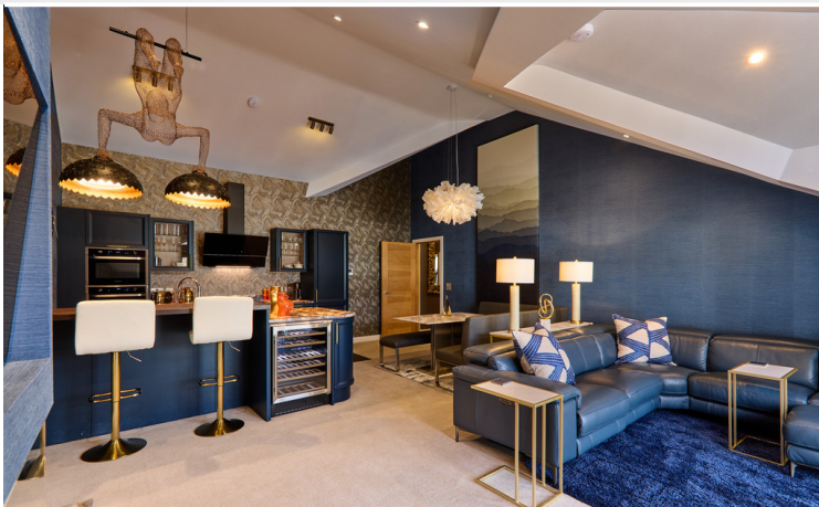
Open plan kitchen / dining / living area