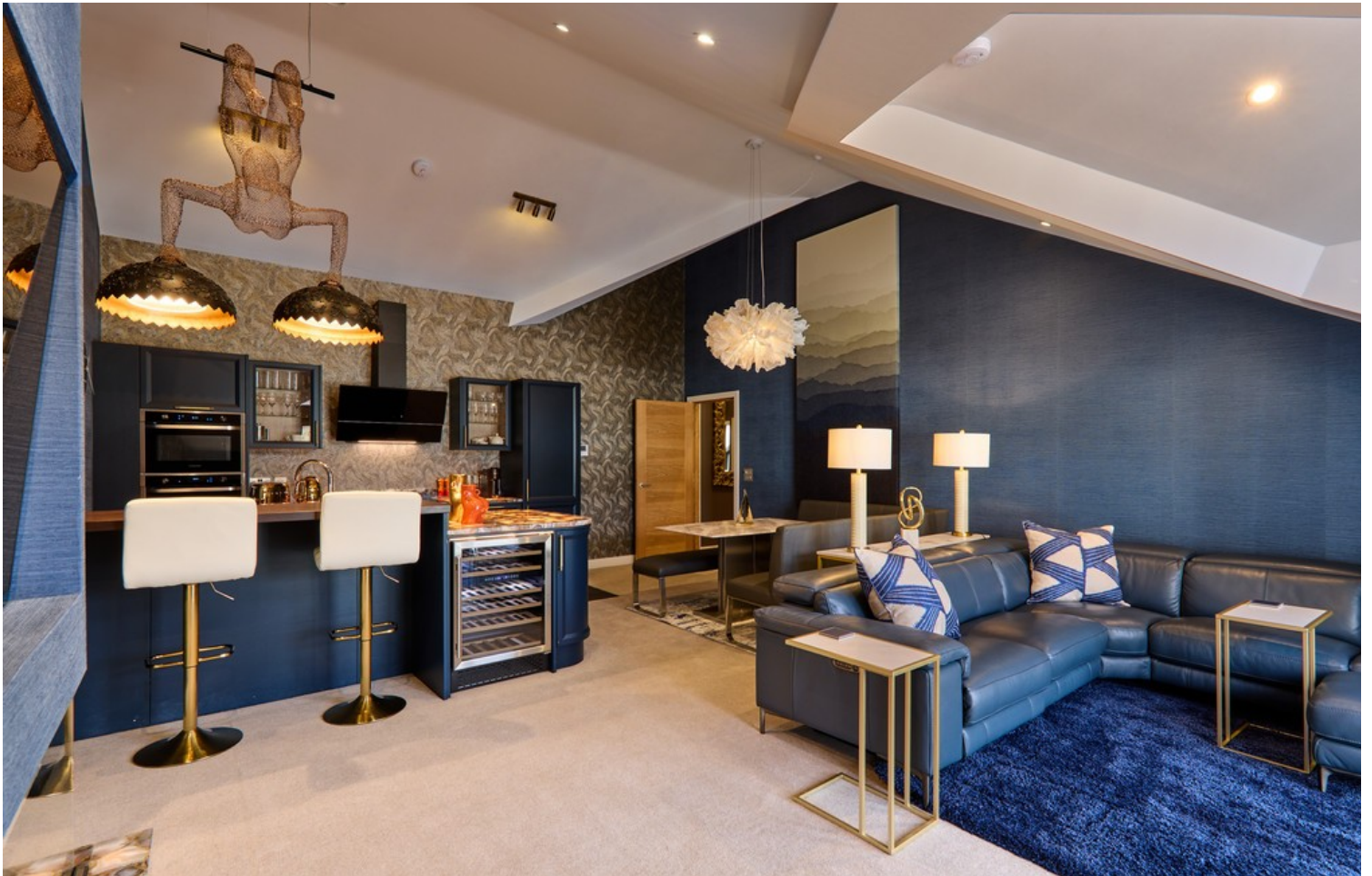
Open plan living / dining / kitchen