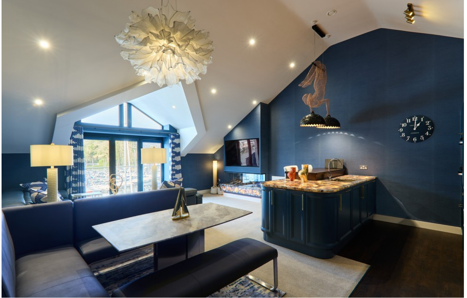
Open plan living area