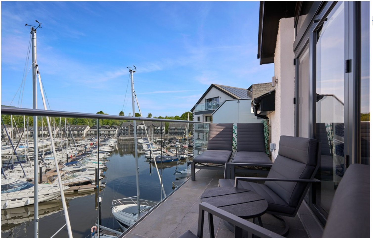
Views from the balcony

Request a Viewing Online or Call 015394 44461