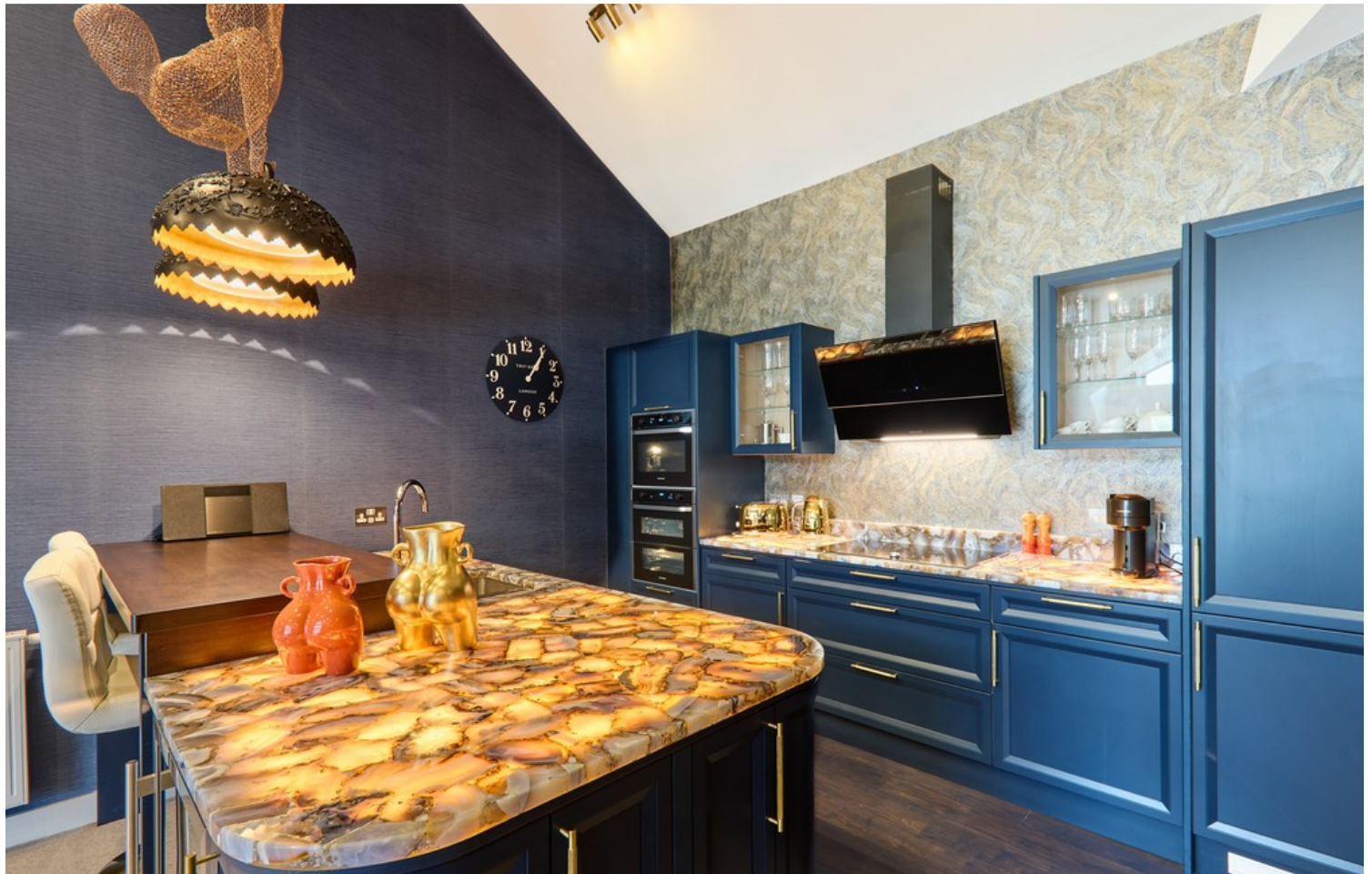
Kitchen / dining area