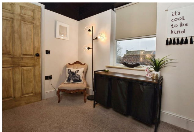
Bedroom Four 10'9" x 7'8" (3.29 x 2.36)

A further double bedroom with double glazed window and radiator.