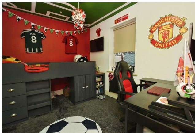
Bedroom Three 10'1" x 7'1" (3.09 x 2.16)

A further double bedroom with double glazed window and radiator.