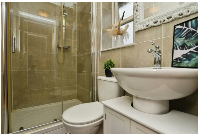
En Suite Bed 1

Tiled En suite with walk in shower cubicle, low level W.C. and pedestal wash basin. Towel heater and double glazed window.