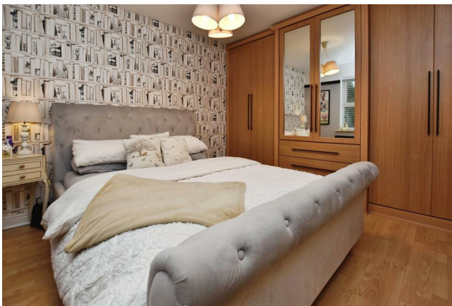
Bedroom One 10'9" x 9'11" (3.29 x 3.04)

A tastefully styled double bedroom with a range of fitted wardrobes and drawer unit. Double glazed window, radiator and laminate flooring. Door to En Suite