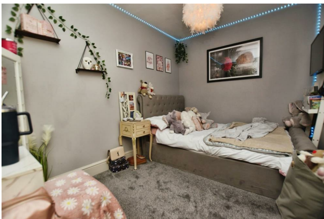
Bedroom Two 10'1" x 8'0" (3.09 x 2.46)

A double bedroom with double glazed window and radiator.