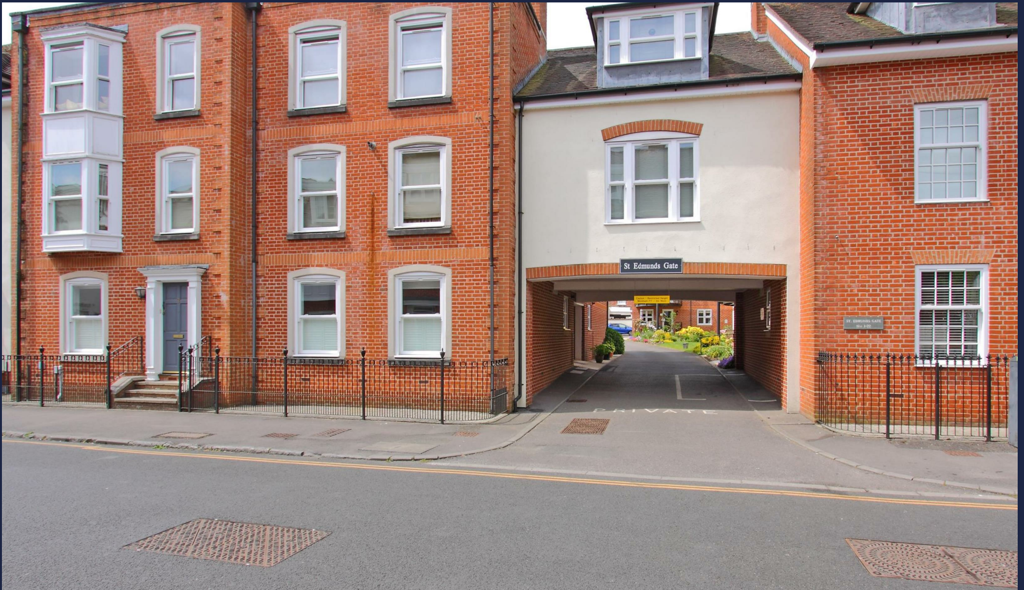
22, St Edmunds Gate, Salisbury