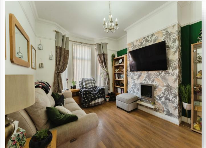
Raffles Road, Tranmere, Birkenhead, CH42 0HW