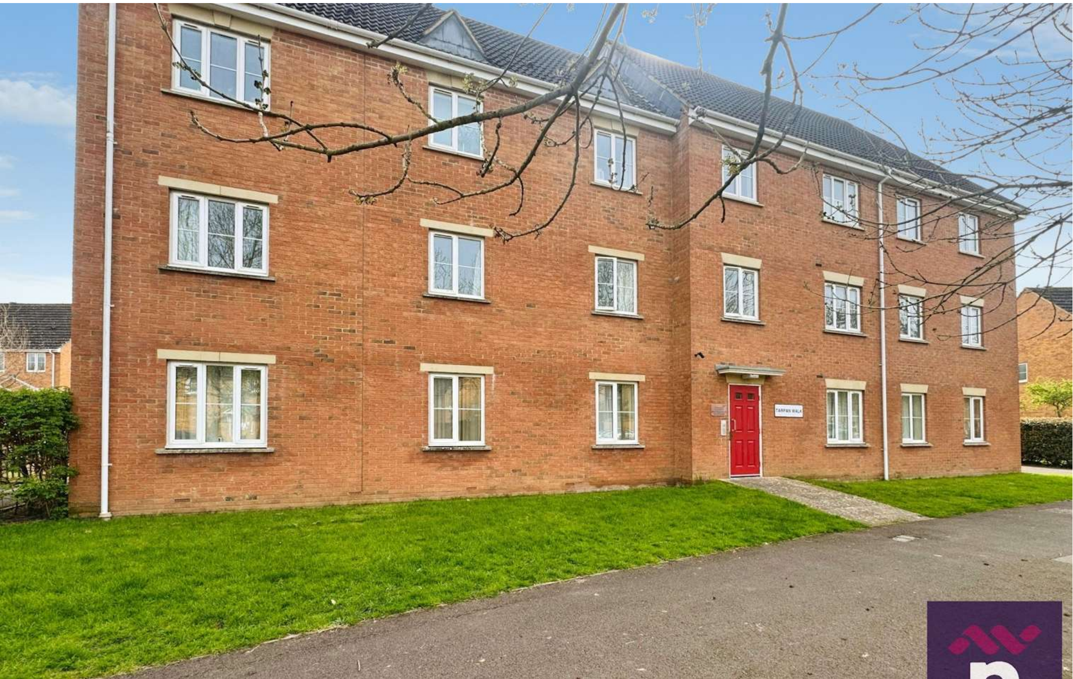
Tarpan Walk, Westbury