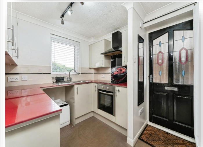
Bluebell Walk, Brandon, IP27 0XG