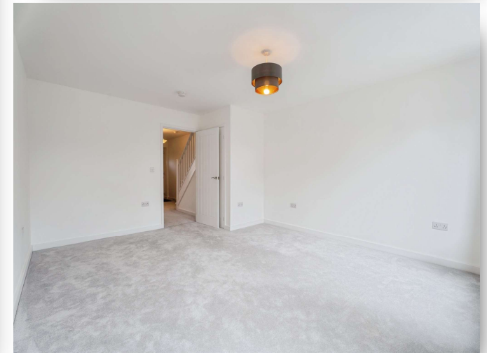
Farrow Road, Bacton, Stowmarket, IP14 4GU