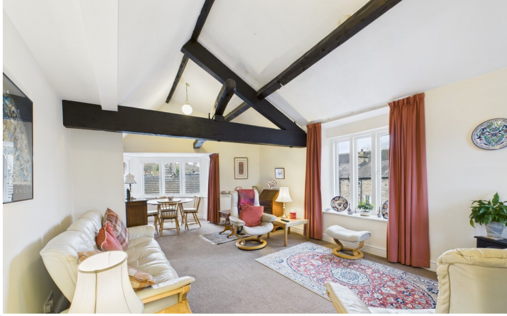
Open plan living / dining / kitchen