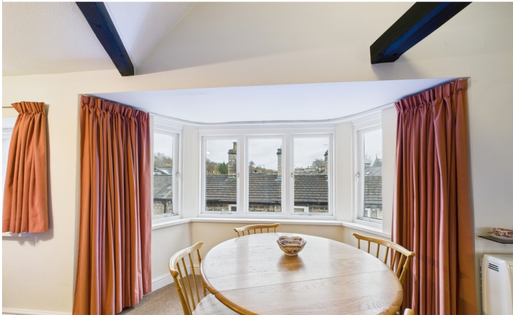
Open plan living / dining / kitchen