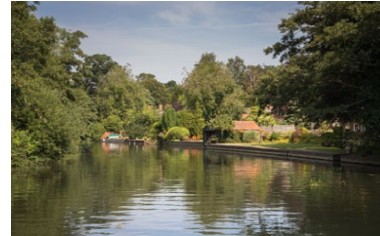
The river Bure.

“There is lovely walk from our garden to Ranworth- the perfect Broads village...”